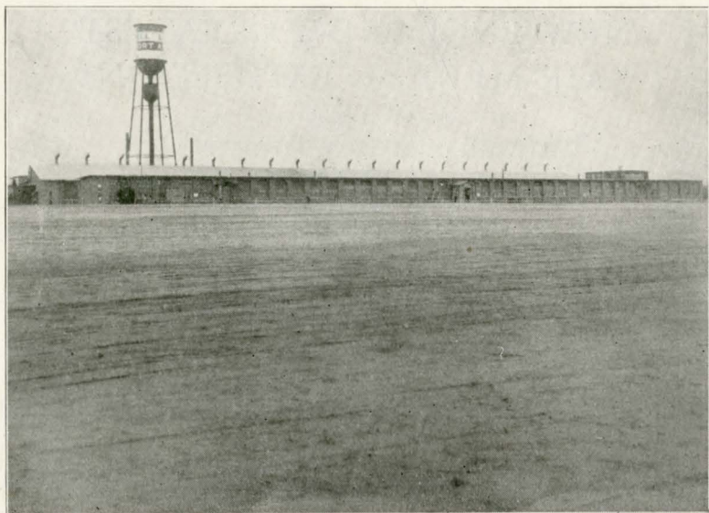
LOWELL AIRPORT Showing Exposition Buildings on Edge of the Field